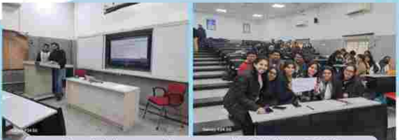
Group Activity on spreading awareness about Viksit Bharat@2047