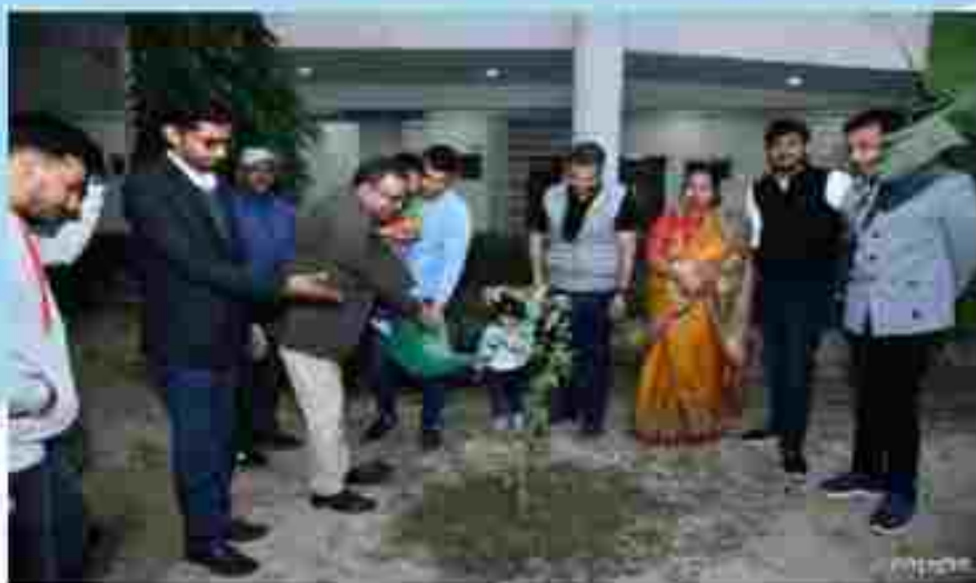
Plantation drive by Alumni Relations Committee