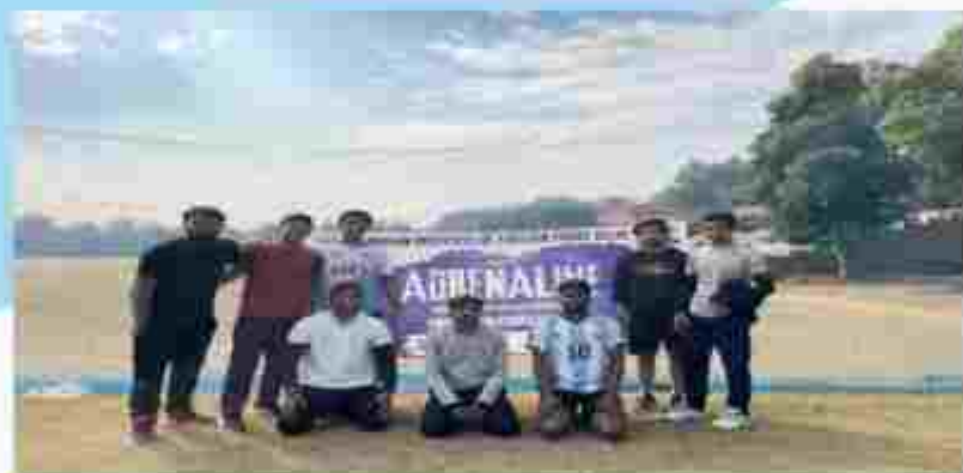
Delhi School of Management participated in the IIFT Delhi Tournament [Adrenaline'24]