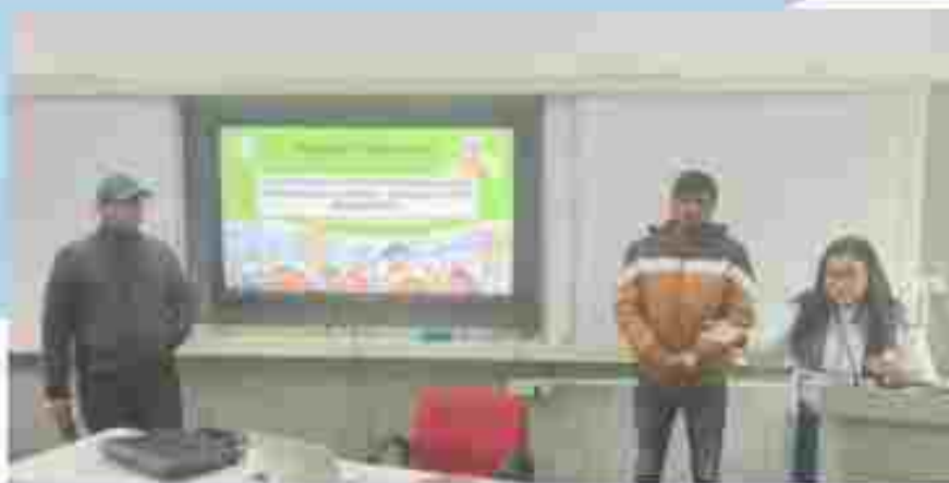
Case study on "Transformation of a Developing Economy into Developed Economy: Aiming for Viksit Bharat @2047"