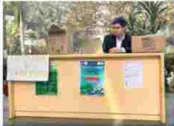
E-waste Drive by Sanrakshan, The Social Club