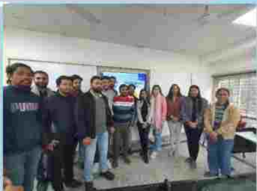
Intra DSM BGMI Tournament