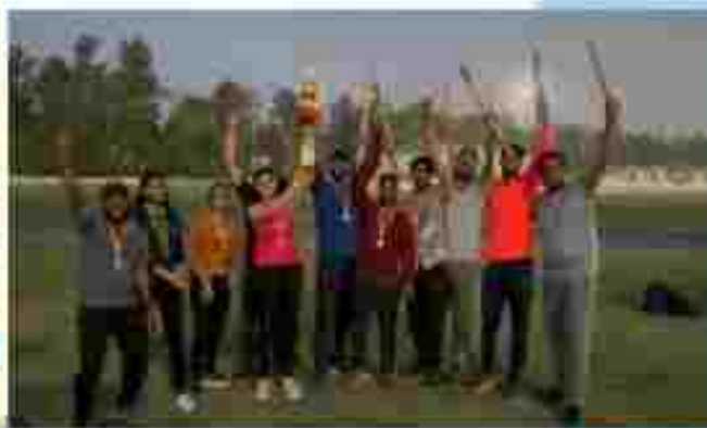
DSMPL'24 - a cricket tournament organized by Sporticus- the Sports Club