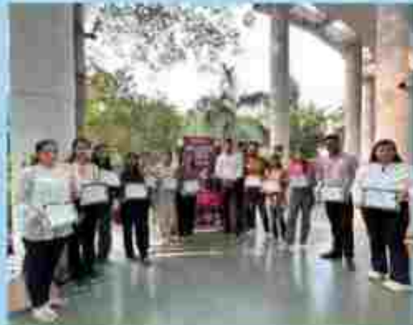
Donation Drive by Netritva, the HR Club