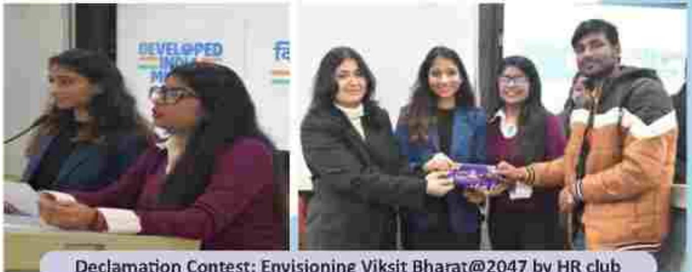
Declamation Contest: Envisioning Viksit Bharat@2047 by HR club

DSM, DTU spearheads Viksit Bharat 2047 initiatives, envisioning a sustainable and inclusive India by 2047. Through research, innovation, and community partnerships, DSM, DTU addresses critical societal challenges such as renewable energy, healthcare accessibility, and environmental conservation. These initiatives empower future leaders to drive transformative change for a thriving nation.